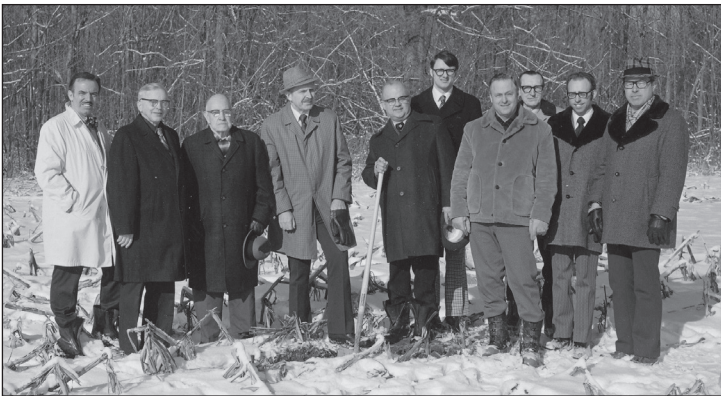
Groundbreaking at Camp Roberts, 1974