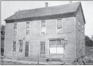
Lima Rescue Mission, 1906