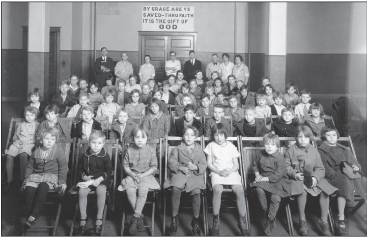
Early children's ministry at Rescue Mission auditorium