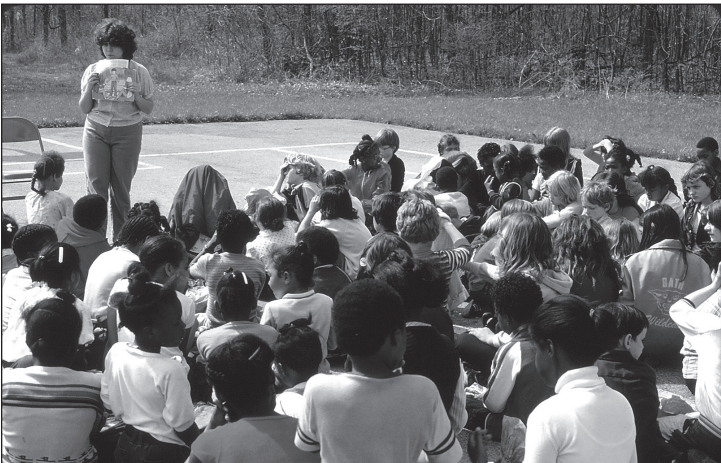
Camp Roberts ministry, 1981