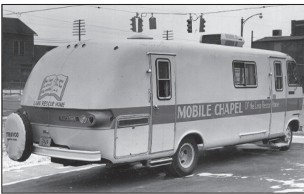
Mobile Chapel, 1972

Another key ministry of the Rescue Mission is outreach to children who attend Lima City Schools. In 1949, a small Child Evangelism class met in the Mission chapel. Over time, this grew to the point where some change obviously needed to be made. Those in attendance ranged from pre-schoolers who came with older brothers and sisters, to Junior High students. This did not make for the most effective teaching. In 1964, God provided the Children's Chapel across from Garfield school. It was now possible to have different age groups come on different days and the teaching could be geared to the particular age group in attendance. With the closing of Garfield school some adjustments had to be made, but the Bible classes continued with children being picked up in vans.