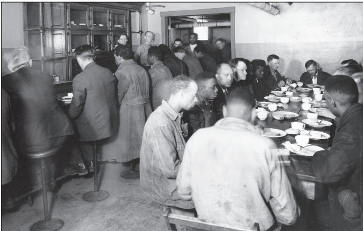
Meal being served, 1930's