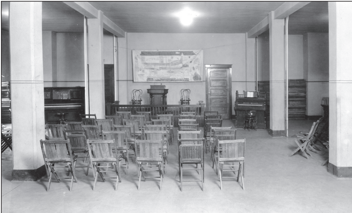
Original auditorium at current facility